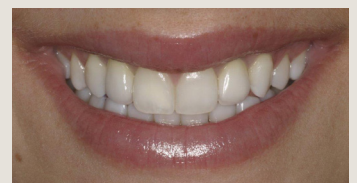
Build back your smile