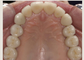
Build back your bite